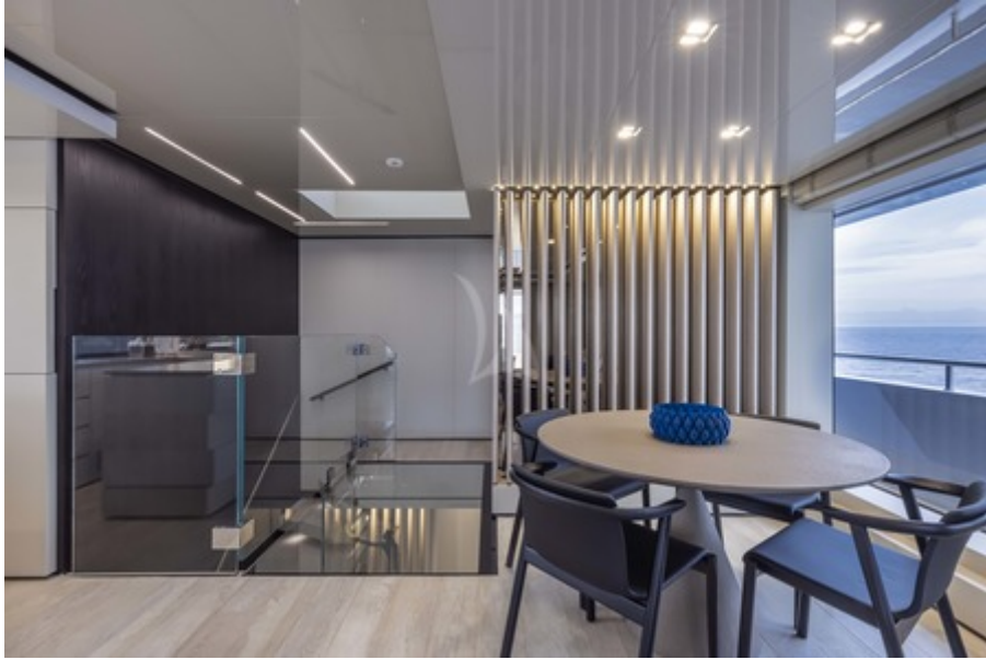
Bridge deck table