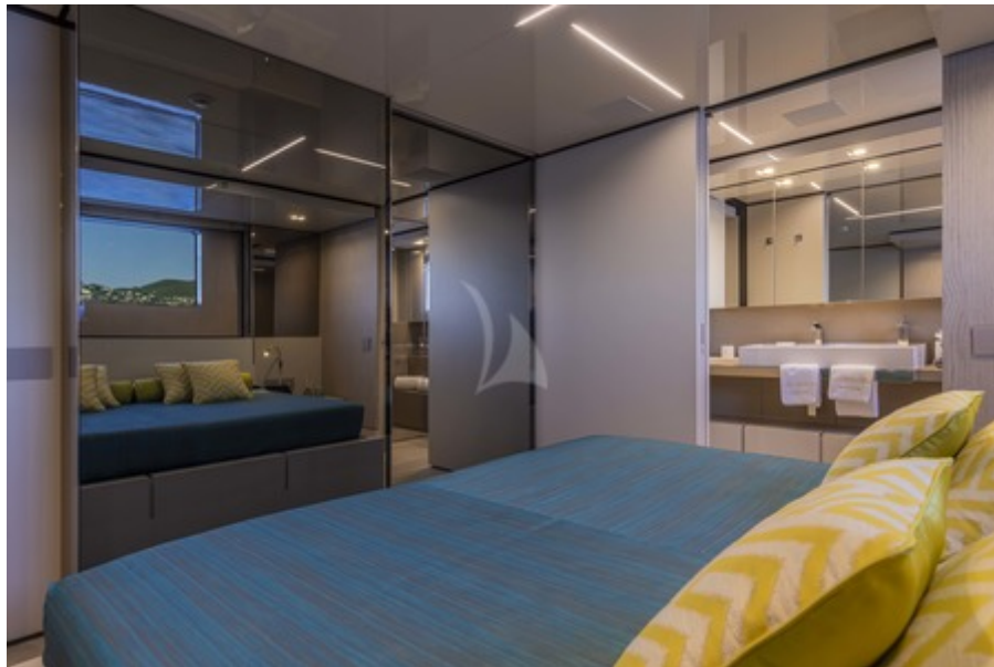
Double cabin 2