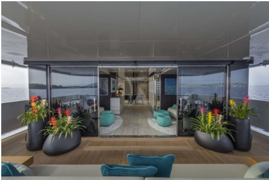
Main aft deck looking forward