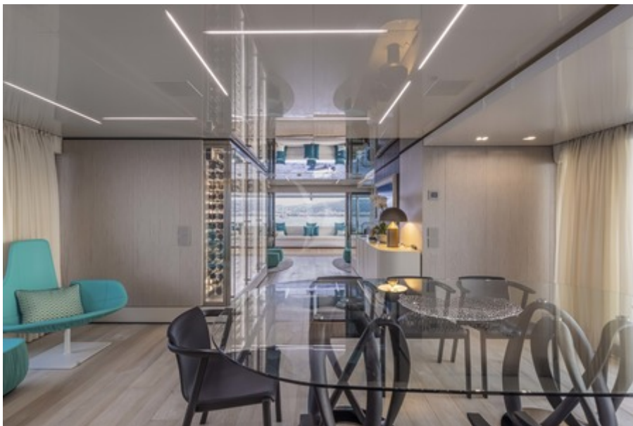
Formal dining in main salon