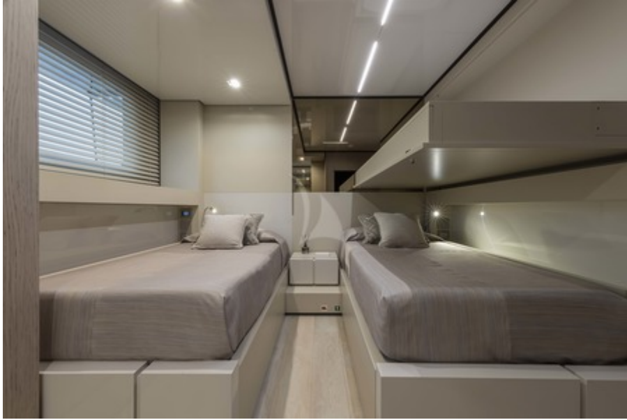
Twin cabin with pullamn