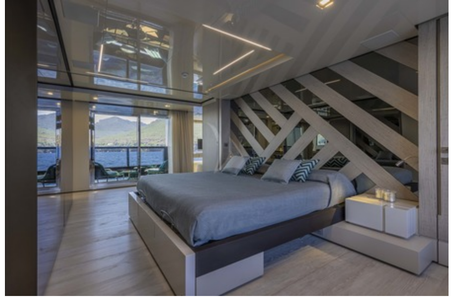
Full beam master stateroom with private balcony