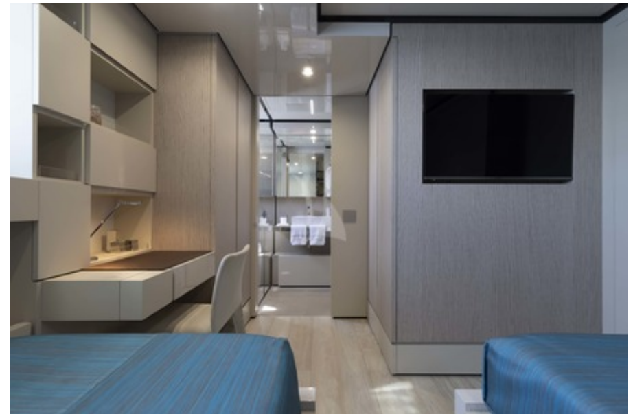
Twin cabin with ensuite