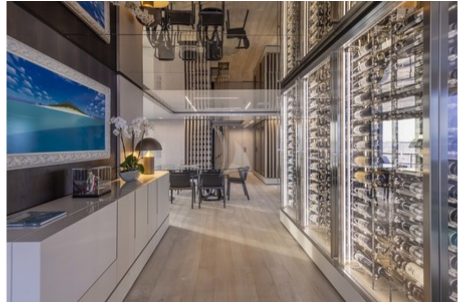
Spectacular wine cellar in main salon