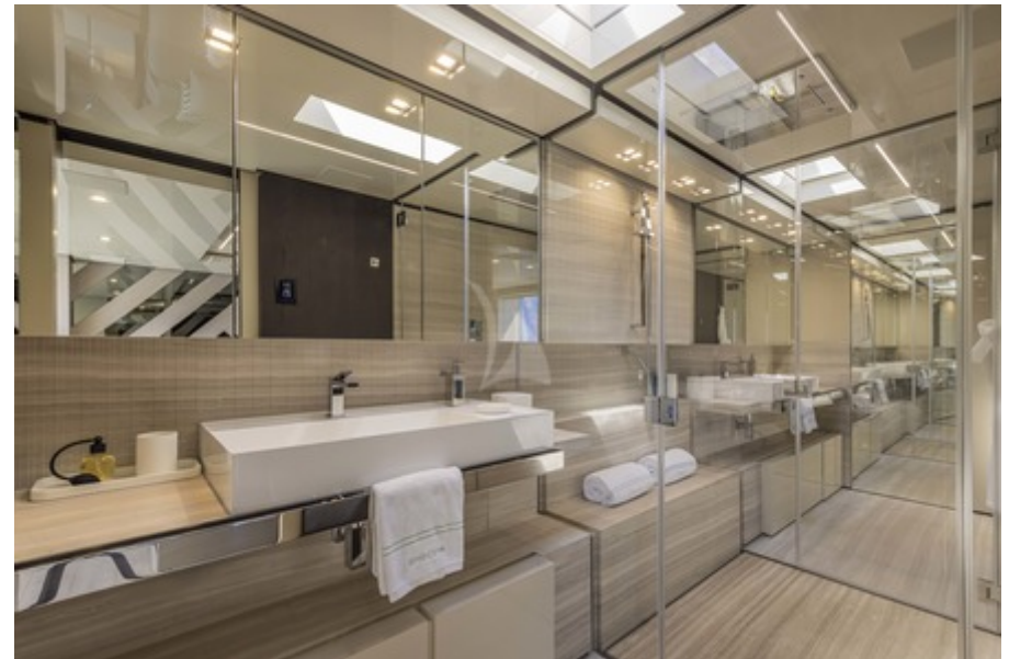
Master stateroom ensuite with his and hers