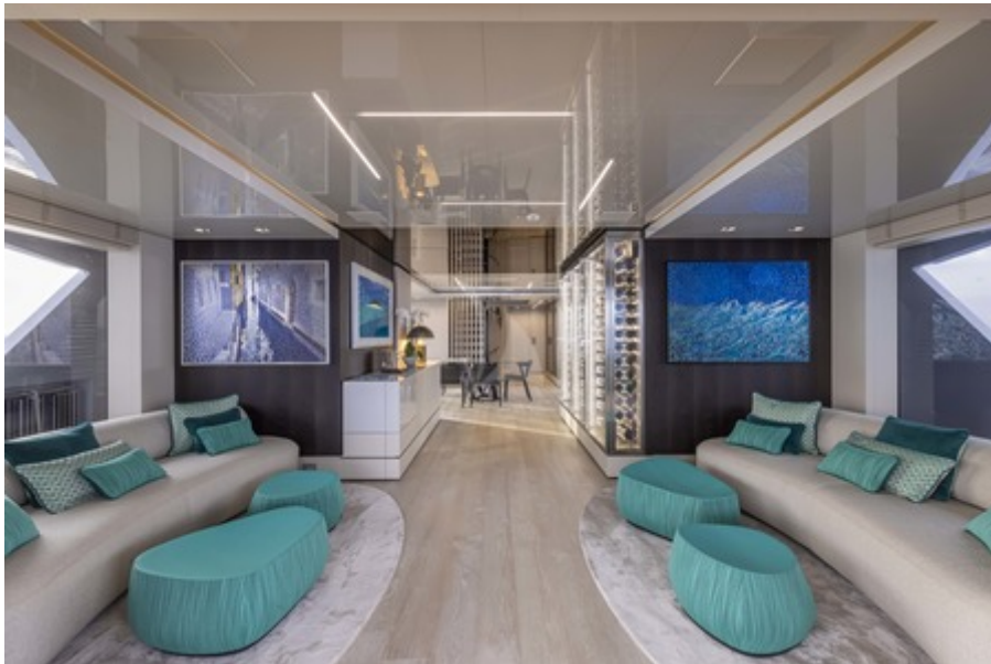
Main salon looking forward