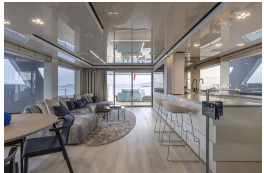
Bridge deck salon