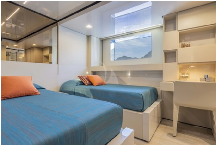
Twin convertible cabin