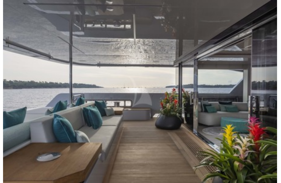
Main aft deck