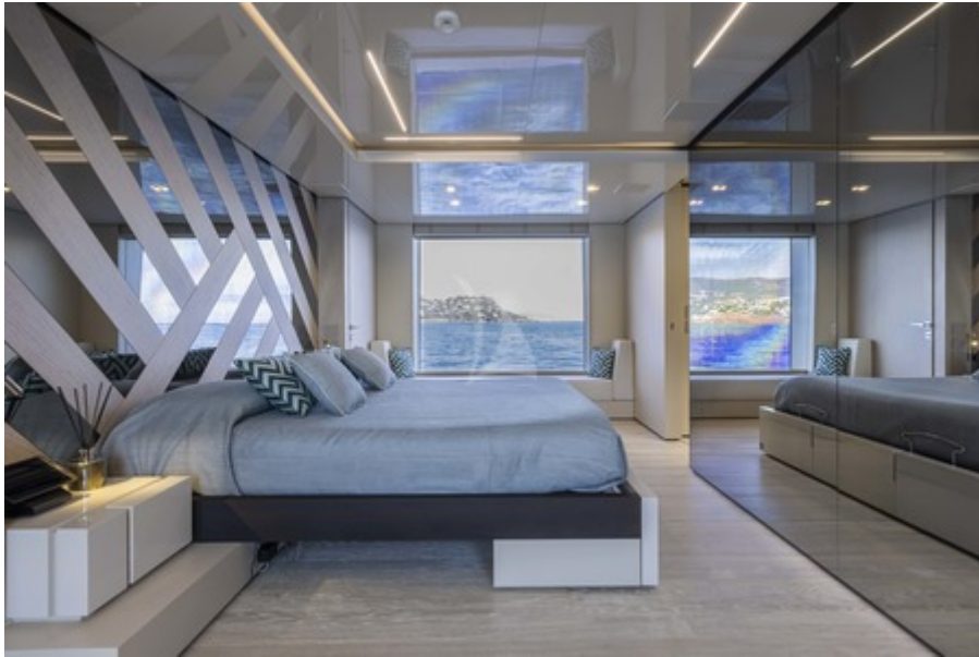
Master cabin with floor to ceiling windows