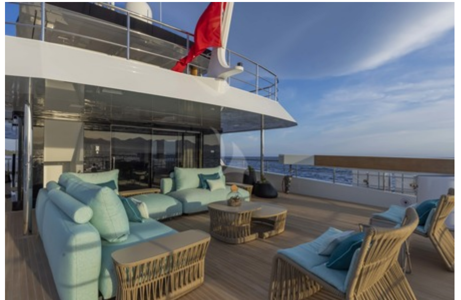
Bridge deck aft