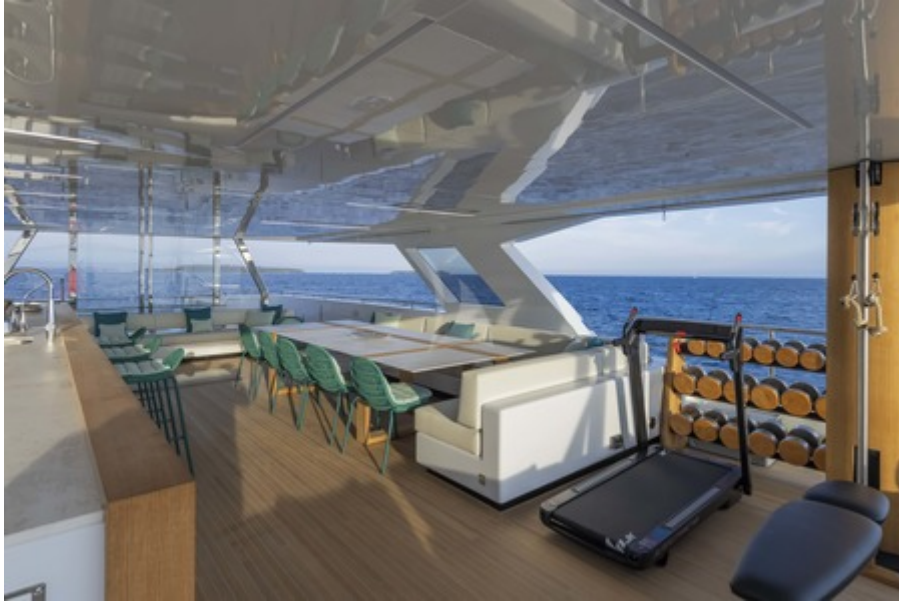
Vast sundeck with gym equipment