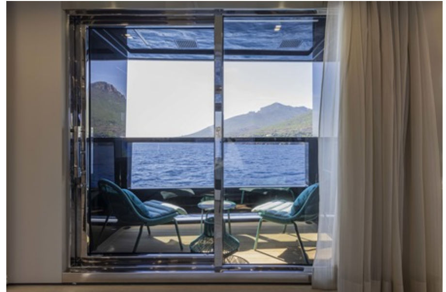
Master stateroom private balcony