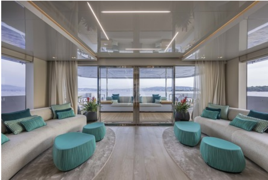
Main salon looking aft